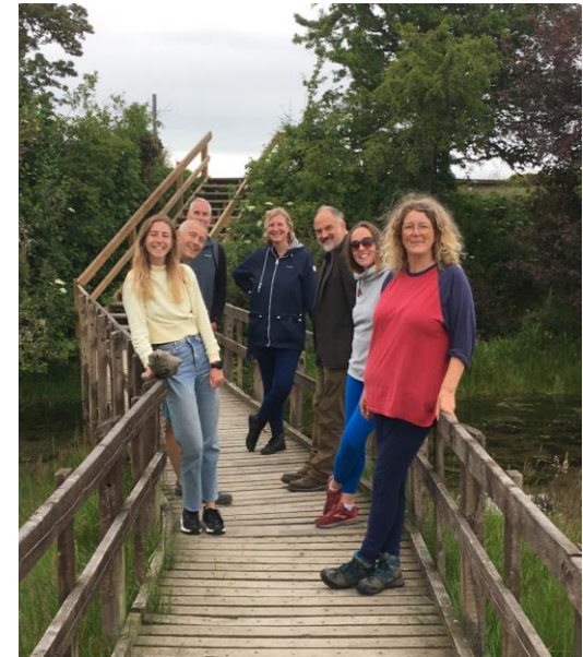
Highlands Adapts Team

Find out more about the story and ethos of Highland Adapts on their website.