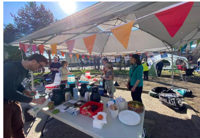
Climate Hub Engagement Event

The Highland Adapts Communication sub-group is a key part of the overarching Highland Adapts Governance model and will continue to play a vital role in helping the partnership achieve its purpose.