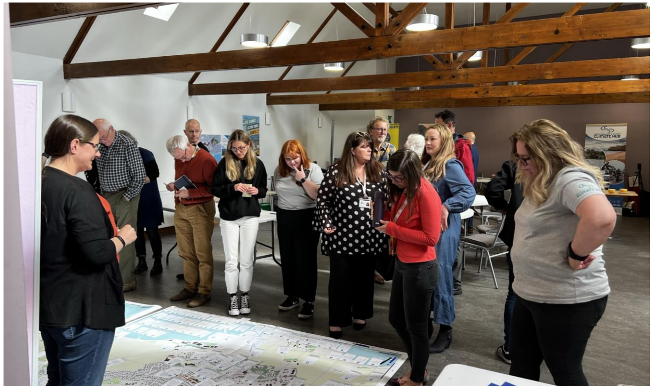
Climate Action Town Place Planning

climate risk assessment needs of partners in Highland could be met by the OpenCLIM integrated assessment model. Highland Adapts will continue to work with the OpenCLIM team as the Highland risk assessment is developed.